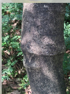
樹幹特徵 the trait on trunk